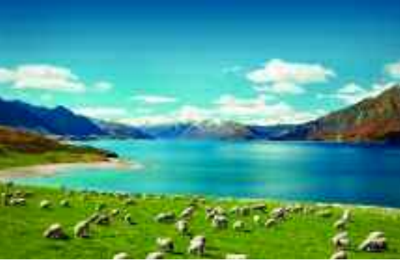
With special thanks to: